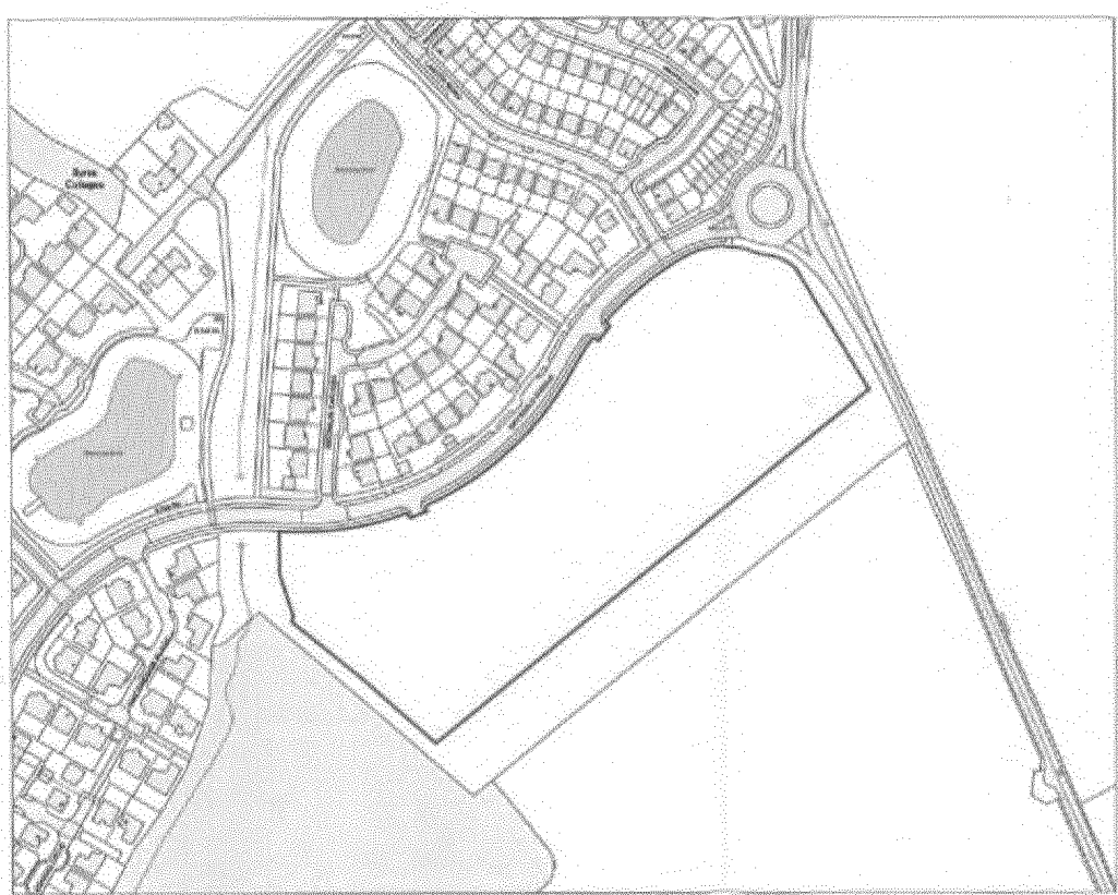
Hill of Kinnaird, SITE J - Title Plan