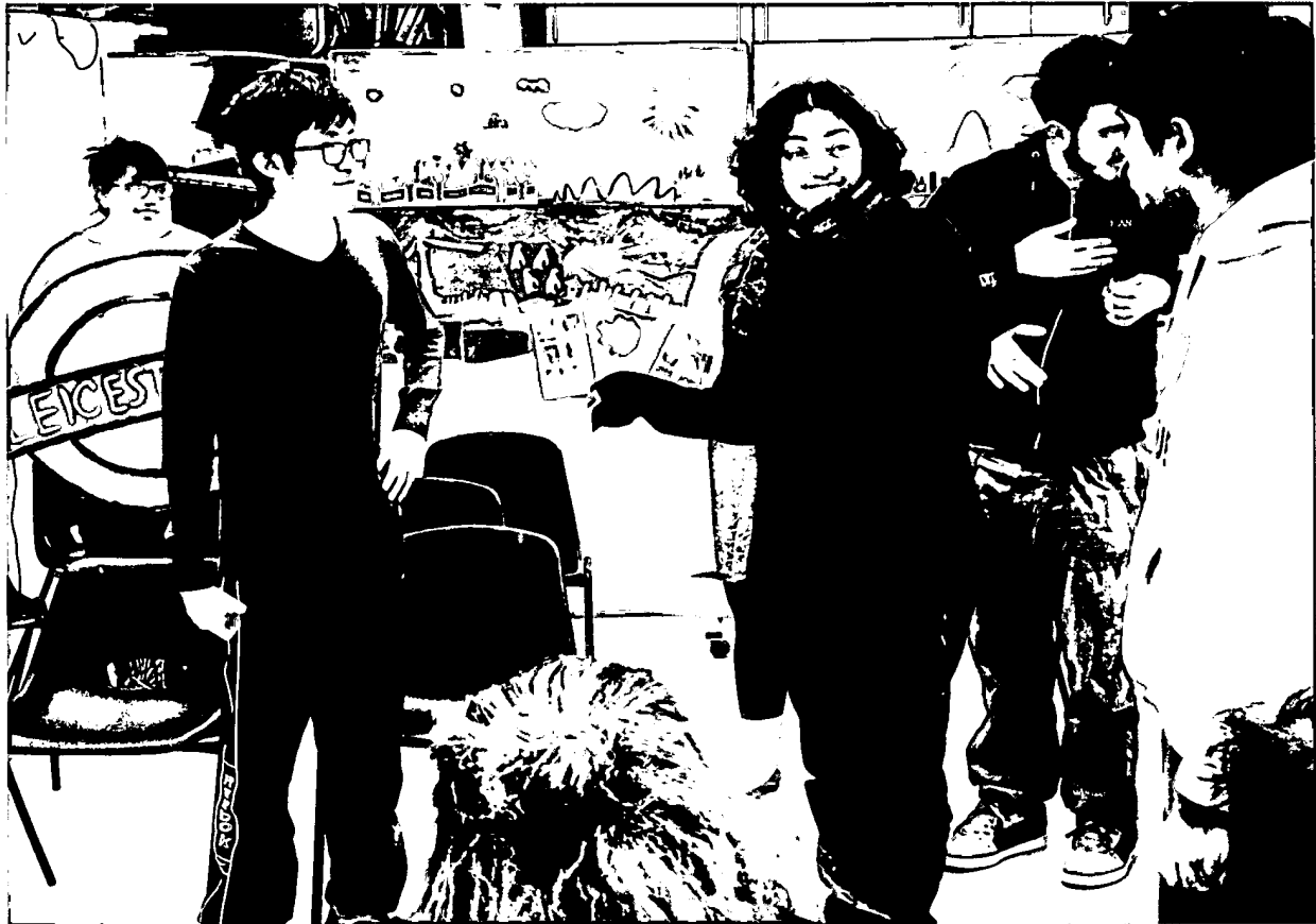
(image - Student discussion in Stories and Set Design workshop, ARTiculate Futures programme)