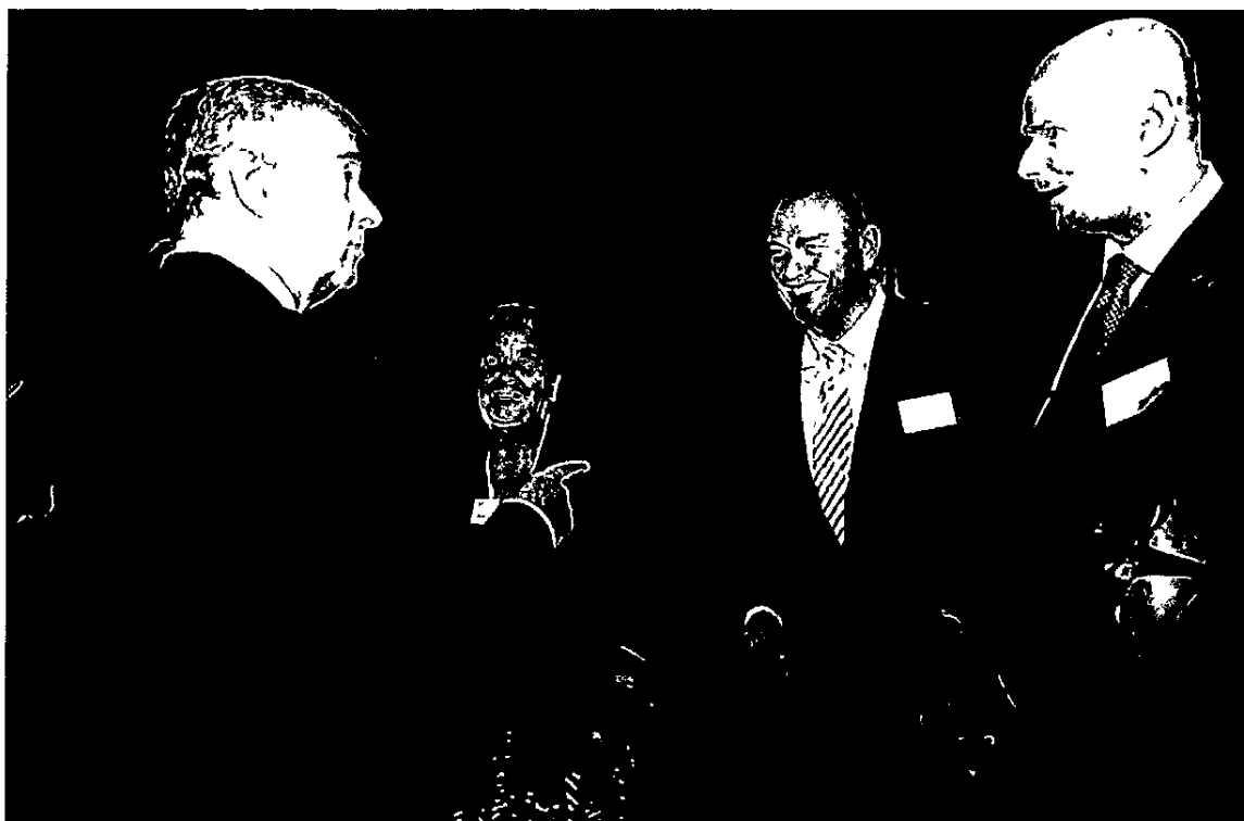
Duke of York Community Initiative Award 2012

We have been recognised as an award winning organisation, both locally and nationally. In 2012 we were reassessed for Investor in People which we have had since 2009. The icing on the cake was to be awarded the much coveted Duke of York Community Award 2012 being the only organisation in Barnsley to win such an award in 2012 was down to everybody's hard work.