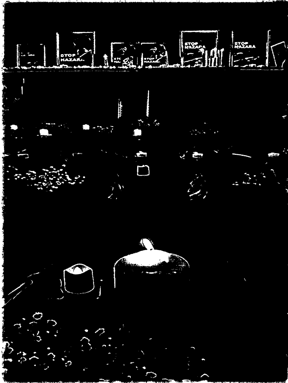
SUMMER 2022. CANDLE VIGIL FOR THE VICTIMS OF ATTACKS ON KABUL SCHOOLS.