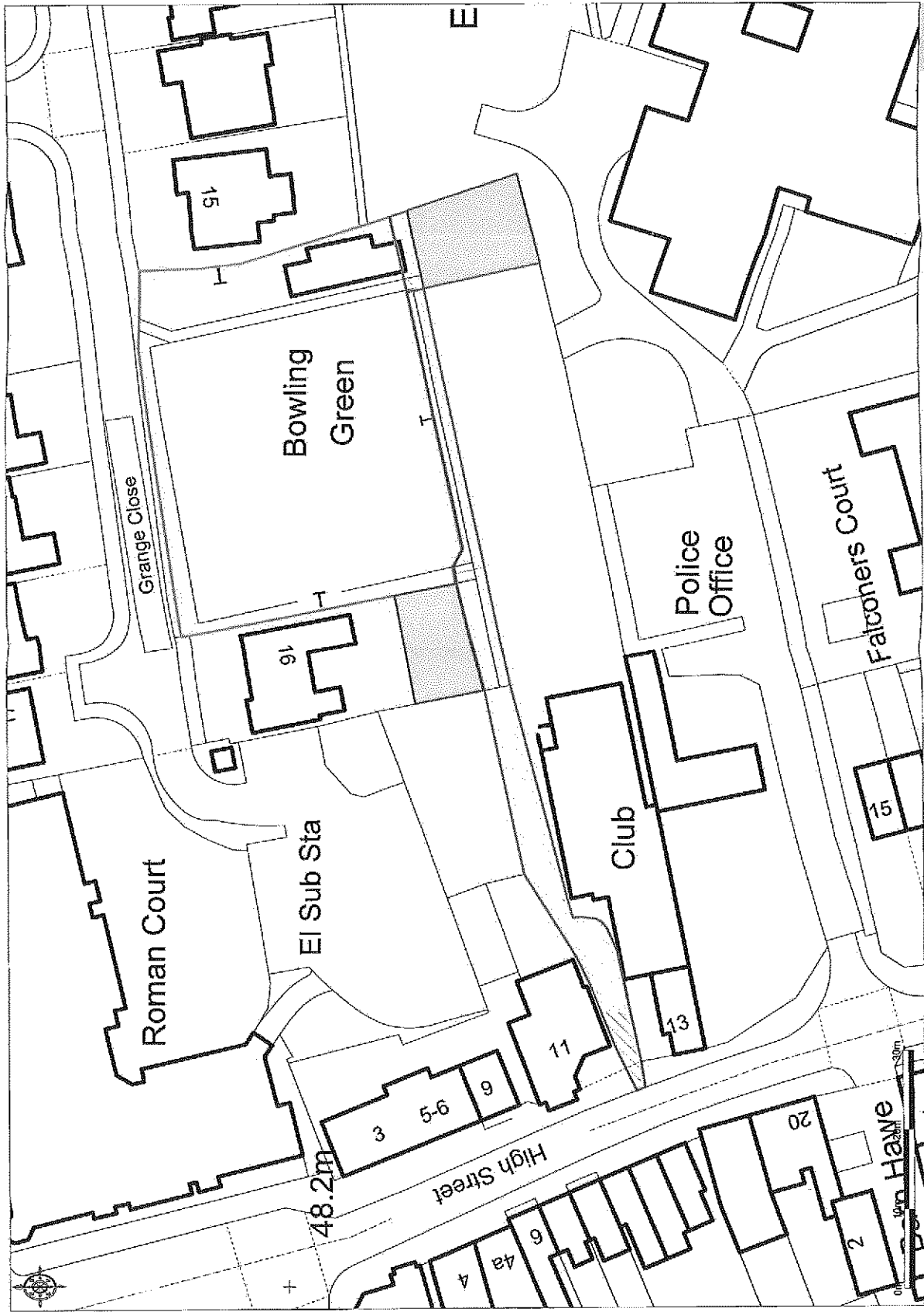
Conveyance Plan, The Former Bowling Green, Edenbridge, TN8 5LT (1:500 @ A3)

© Crown Copyright 2016. All Rights Reserved. Ordnance Survey Licence Number: 100025312. Road Survey - 12/18